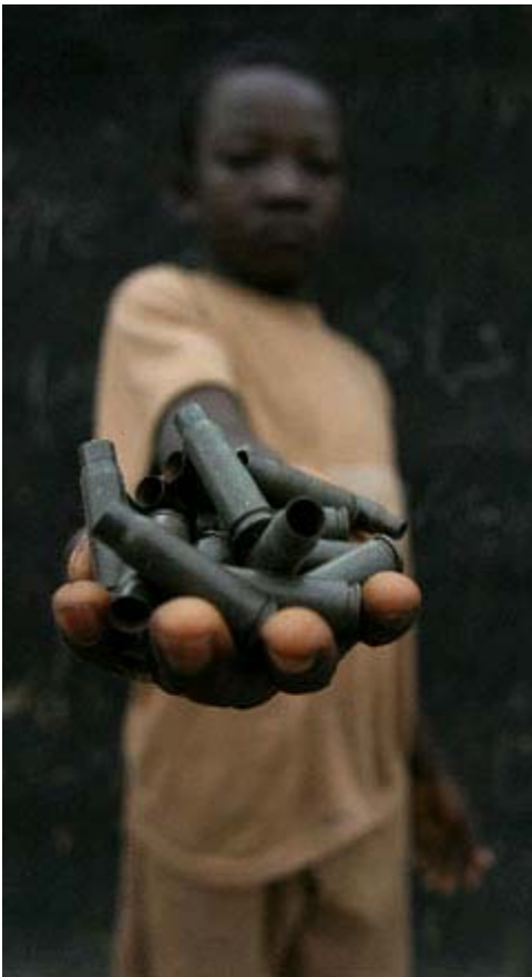
A child at a refugee camp in the Central African Republic is loaded with ammunition.

Building on this historical relationship between temperature and conflict, the researchers then used projections of future temperature and precipitation change to quantify future changes in the likelihood of African civil war. Based on climate projections from 20 global climate models, the researchers found that the incidence of African civil war could increase 55 percent by 2030, resulting in an additional 390,000 battle deaths if future wars are as deadly as recent ones.